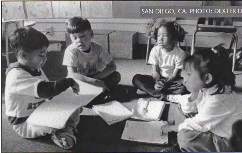
SAN DIEGO, CA.